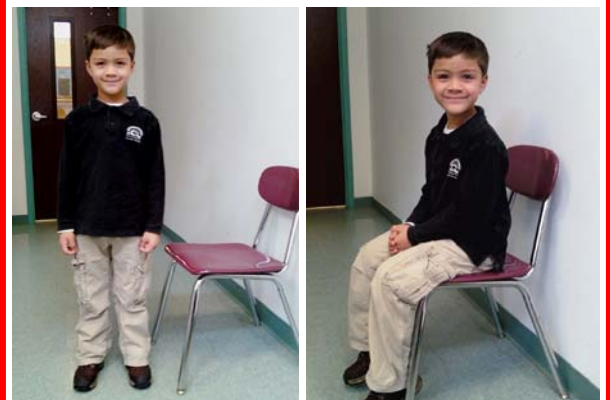
Standing / Parado