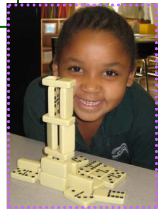
These are pictures from a Social Studies project on Building Community. Students made buildings and wrote about them.