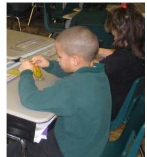
Practicing with our clocks on how to read time!