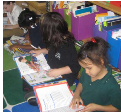
Working hard on learning about wants and needs!