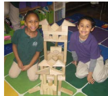
We love to build together!