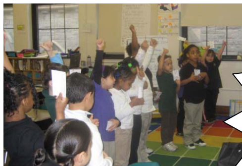
Figuring out positions from 1 st to 20 th !