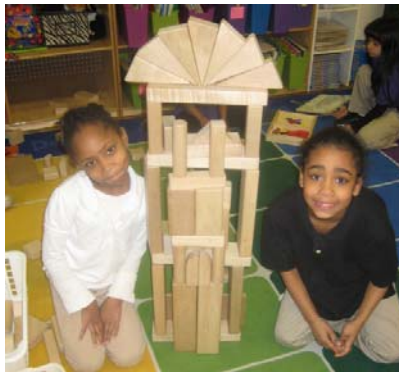
We love to build!

~ Next Week our story will be Peter's Chair . Have you ever given away something special? ~ 'Words to Know' to practice at home: remember, room, stood, picture, though